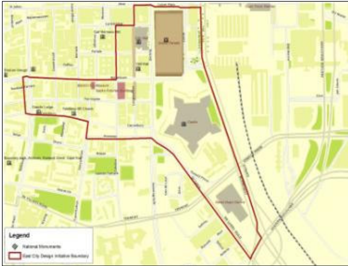
Figure 2: East City Design Precinct proposed boundary