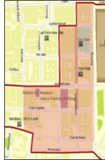
Figure 3: Core of the Design Hub

More especially the area bound between Buitenkant to Primrose, Darling to Barrack Streets.