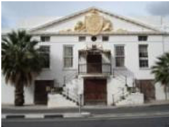
Figure 1: The Granary

The map to the left shows the East City Design Precinct / Park proposed boundaries as described above in context with the broader central city.