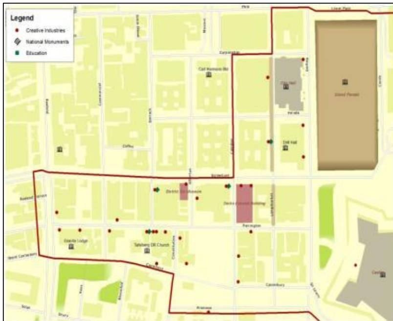
Figure 4: Creative Industries and National Monuments

This is an area which has significant number of creative industries as this map below (connected the list of 58 entities at the end of this annex shows). Key entities in this area include fashion related groups including a number of CMTs (not marked in the